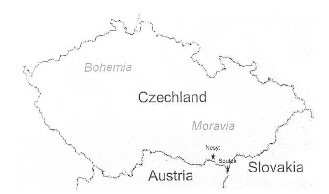
Figure 1. Map of study sites in the Czech Republic.

typical, habitats for the monitored region (Figure 1).